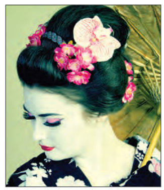
TransChrome print driver