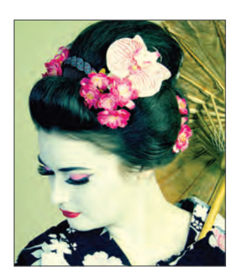
Visible Print Output

Stealth-enabled 4 Channel invisible ink inkjet device