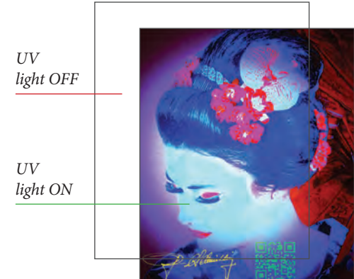
Invisible Print Output