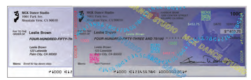
Original and secure check with MICR and invisible fluorescent graphics and barcode.