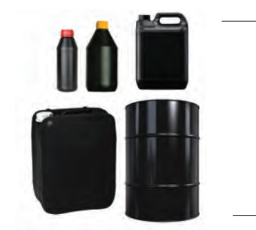
INKVERSE<sup>™</sup> connects with or replaces conventional bulk containers