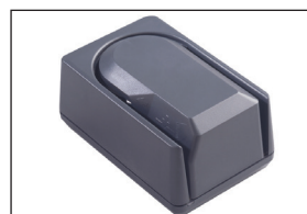
VersaScan 21 UltraScan X1-UV