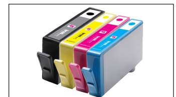
VersaInk 252XL Cartridges