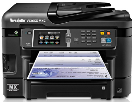
Mobile Enabled & Flexible Paper Handling

A breakthrough all-in-one printer that delivers enhanced color and MICR printing flexibility. The VersaJette™ 36XX MX MICR Color offers enhanced productivity and flexible paper handling for users with a requirement to print color and MICR marks, barcode images and text (E13B, CMC7) on documents, photos, labels, certificates and more. Powered by unique x-nano™ Color and MICR printing technology, the VJ 36XX-MX delivers performance beyond any standard color inkjet and laser. This breakthrough all-in-one printer produces fast, high-quality color and MICR prints. This wireless printer easily prints from tablets and smartphones. Three paper trays offer added versatility—load up to 500 sheets in the front, and use the rear tray for envelopes and specialty paper. Additional features include auto 2-sided print/copy/scan/fax and a 3.5" color touchscreen.