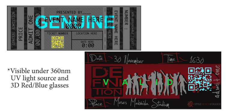
Tickets with 2D UV security barcode applications

Add invisible 2D and 3D compliant images* and artwork to personal and business documents, valuable items such as tickets, labels, certificates, tags, ID badges and more. The included color variety of inks allow users to recreate standard visible content printed in CMYK colors as invisible add-on, where applicable.